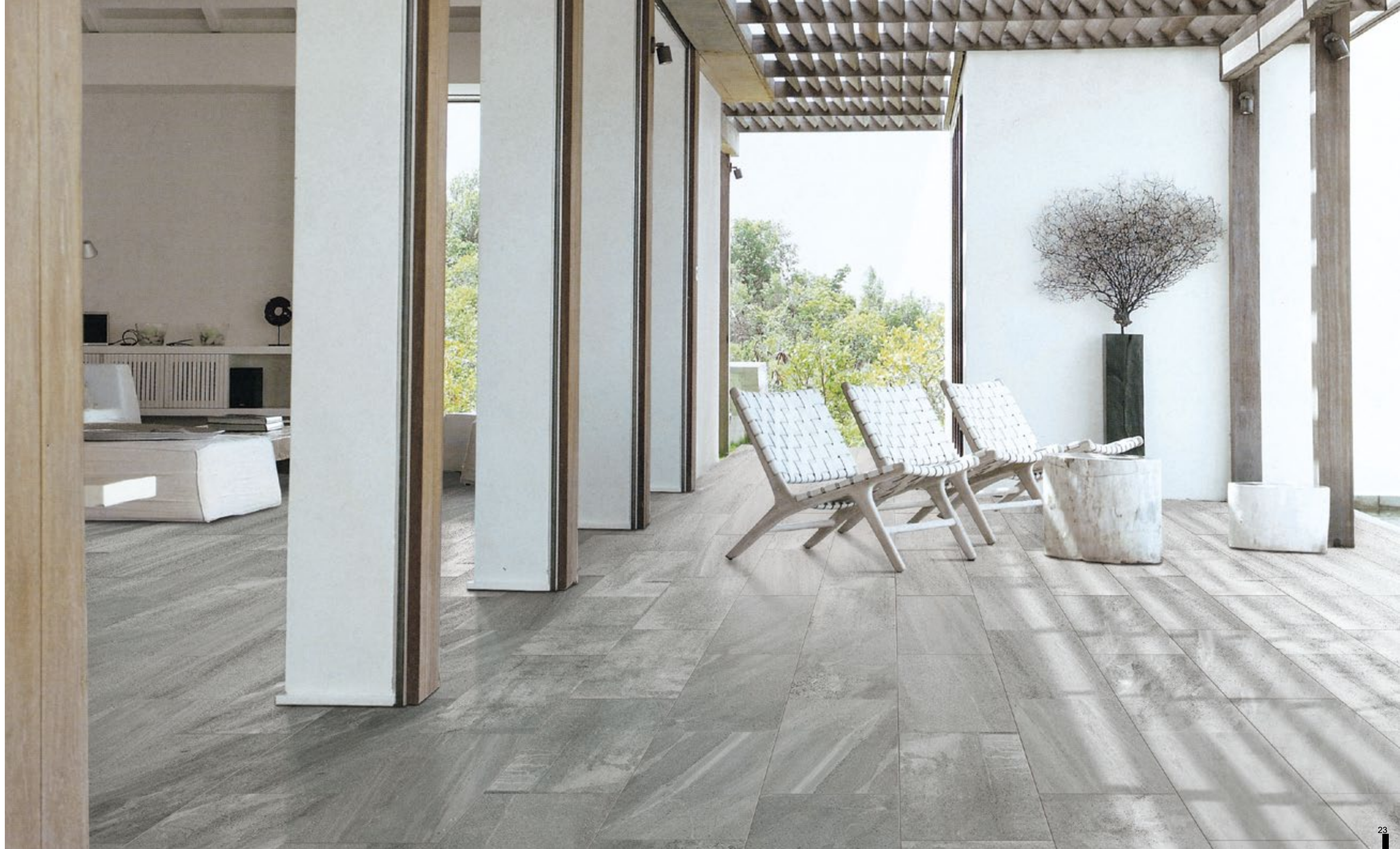
PARTNER FLOOR: 300X900mm