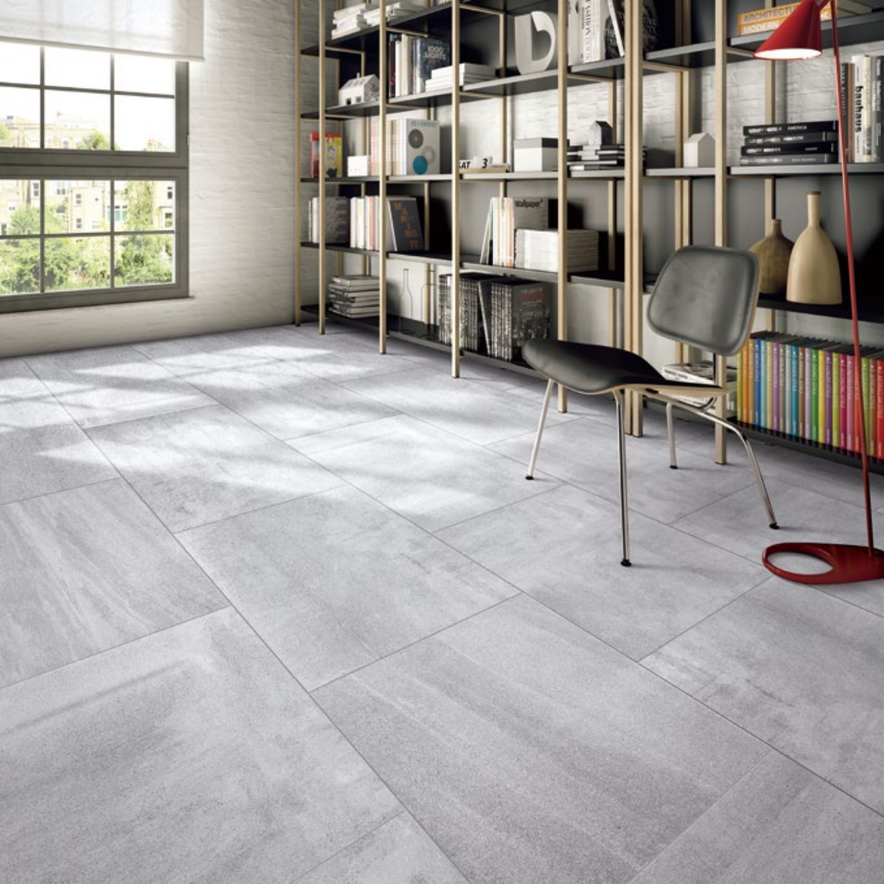
PARTNER-L FLOOR: 600X900mm