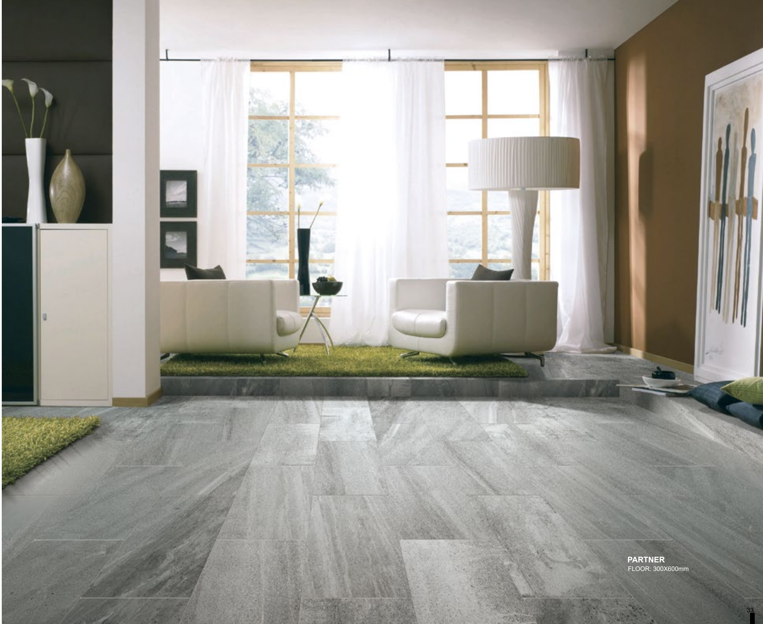
PARTNER FLOOR: 300X600mm