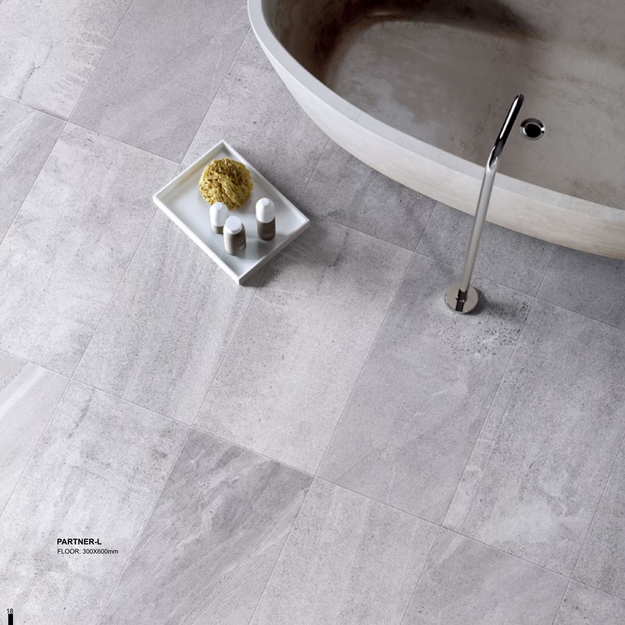
PARTNER-L FLOOR: 300X600mm