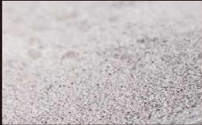
GRANIGLIA (FINE GRAINED) (G)