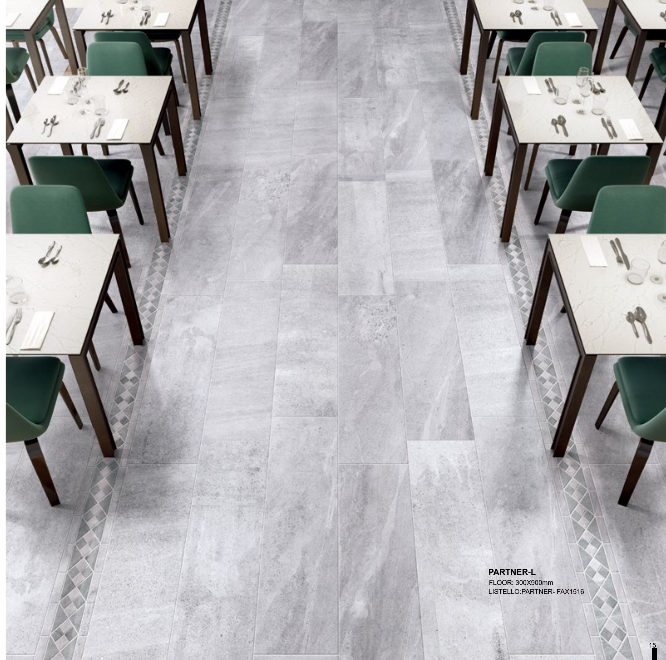
PARTNER-L FLOOR: 300X900mm LISTELLO: PARTNER- FAX1516