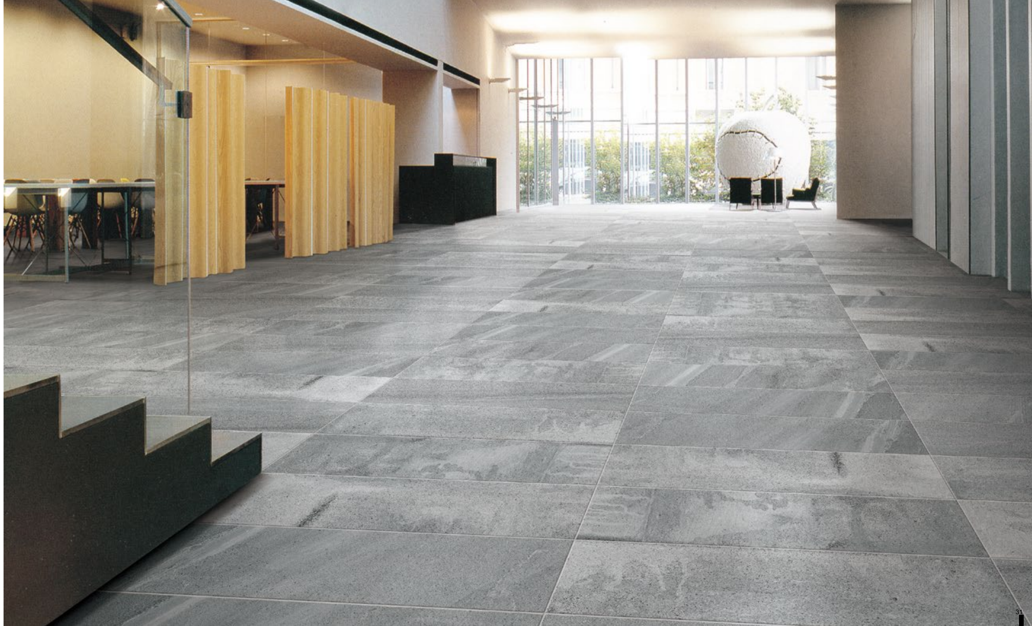
PARTNER FLOOR: 600X900mm