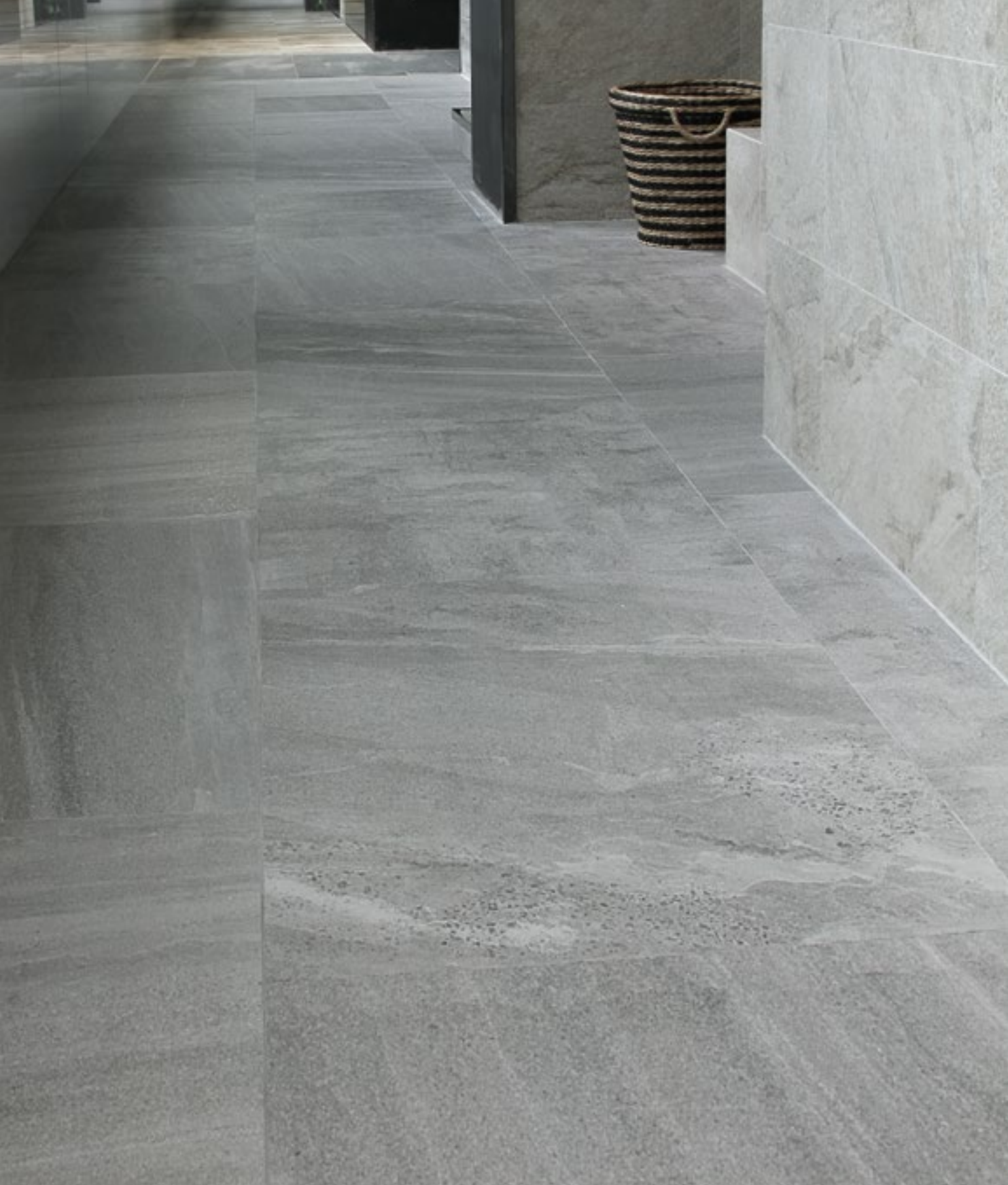
PARTNER FLOOR: 600X600mm