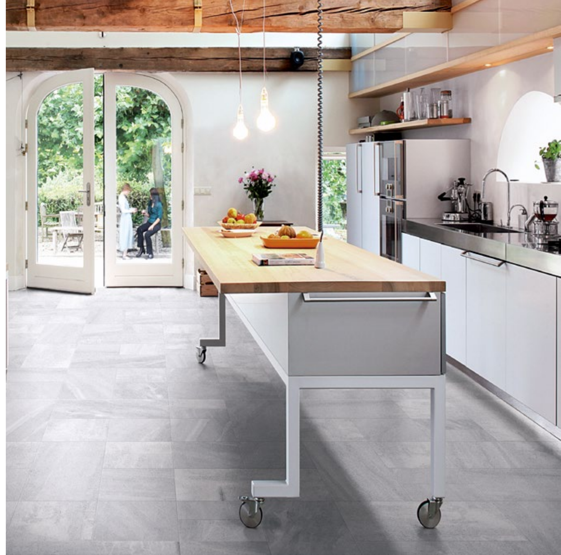
PARTNER-L FLOOR: 150X300mm 300X600mm 300X300mm