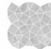
PARTNER-LG MA 14 / 305x300