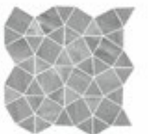
PARTNER-G MA 14 / 305x300