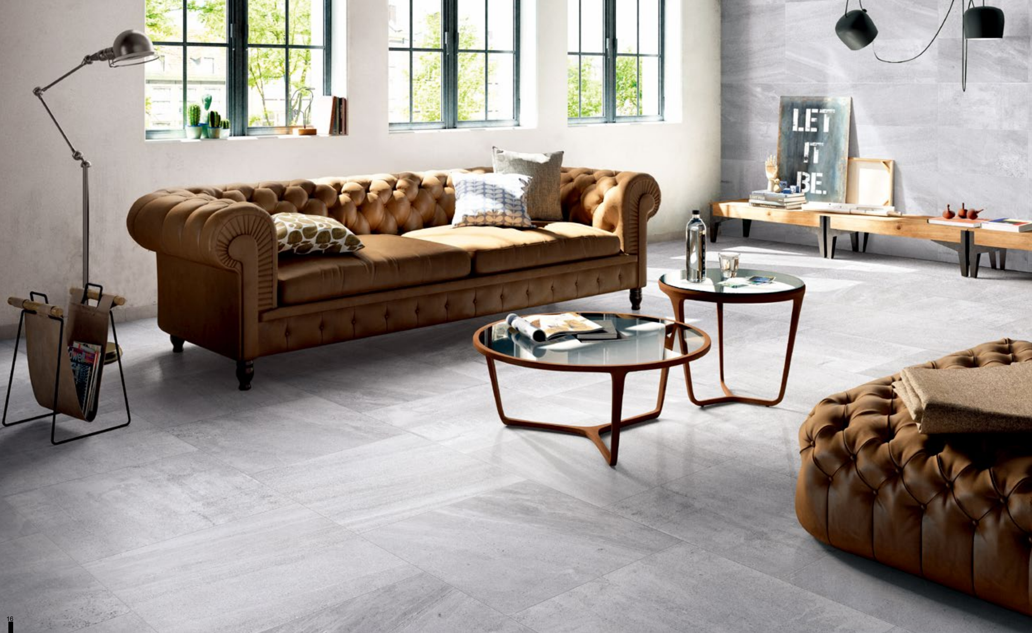
PARTNER-L FLOOR: 600X600mm