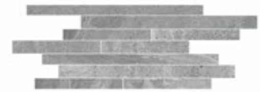
PARTNER-G MA 10 / 810x275