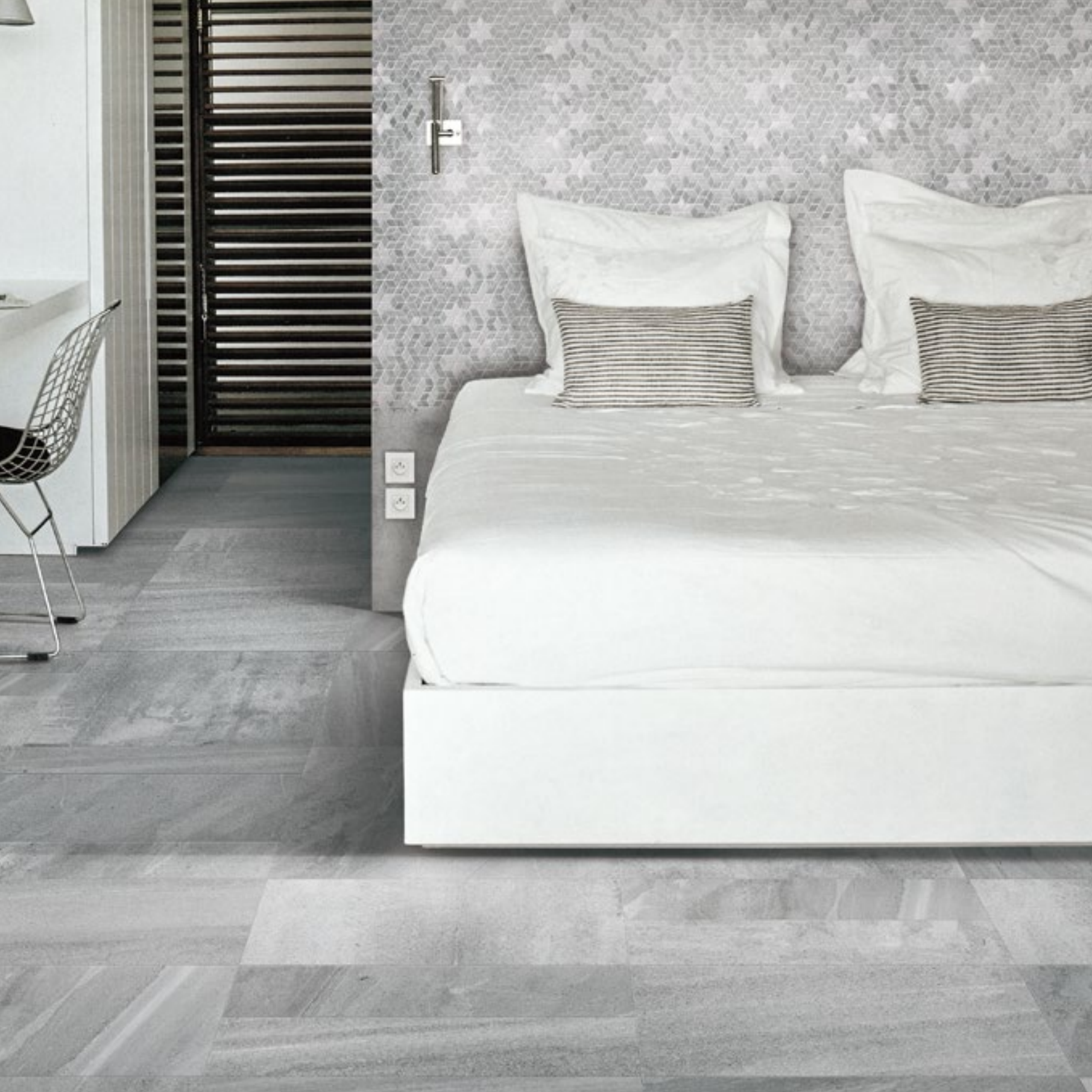
PARTNER FLOOR: 600X600mm MOSAIC: PARTNER-MA16S