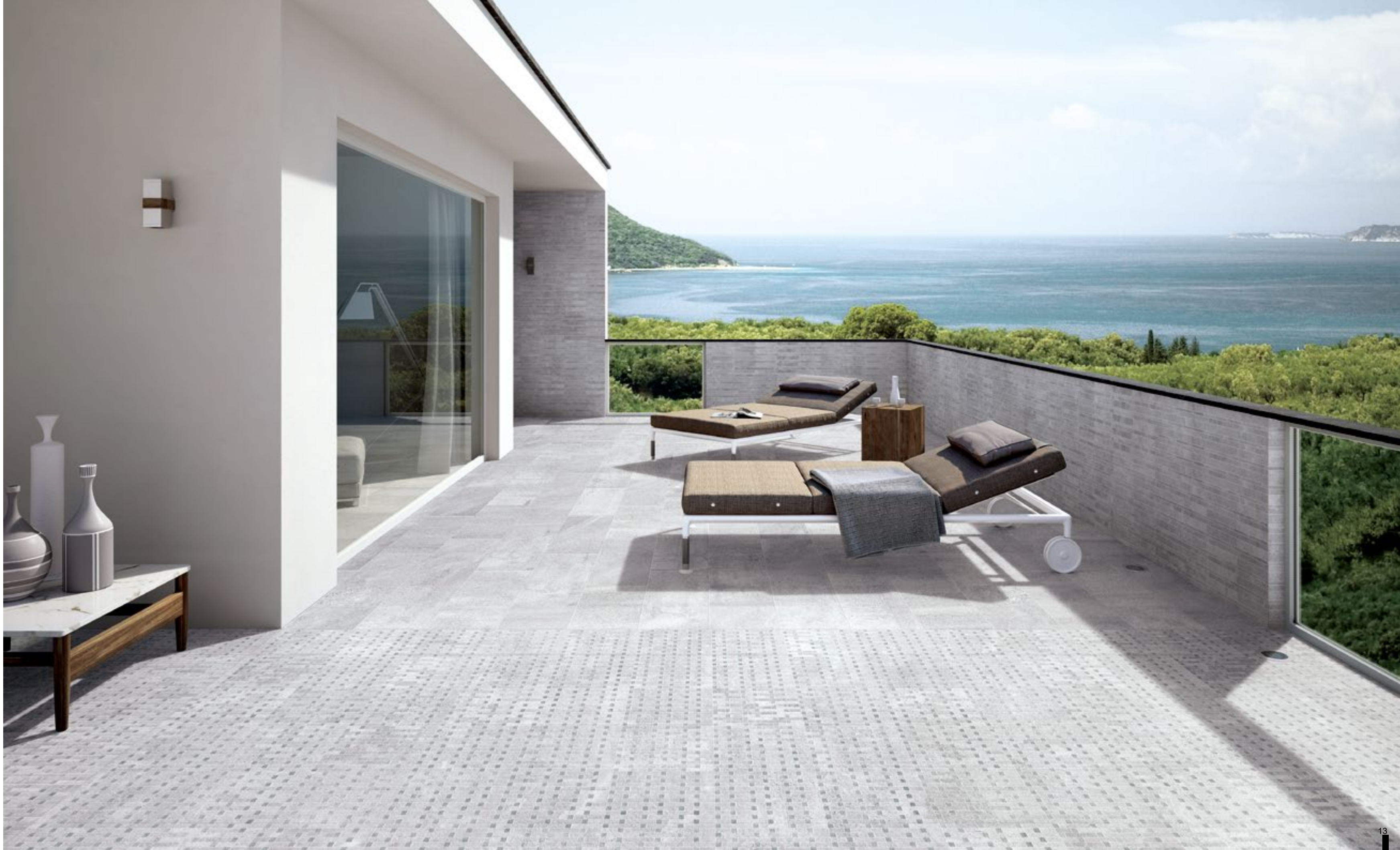
PARTNER-L FLOOR: 300X900mm WALL: 150X900mm MOSAIC: PARTNER-L-MA12 MOSAIC: PARTNER-L-MA7