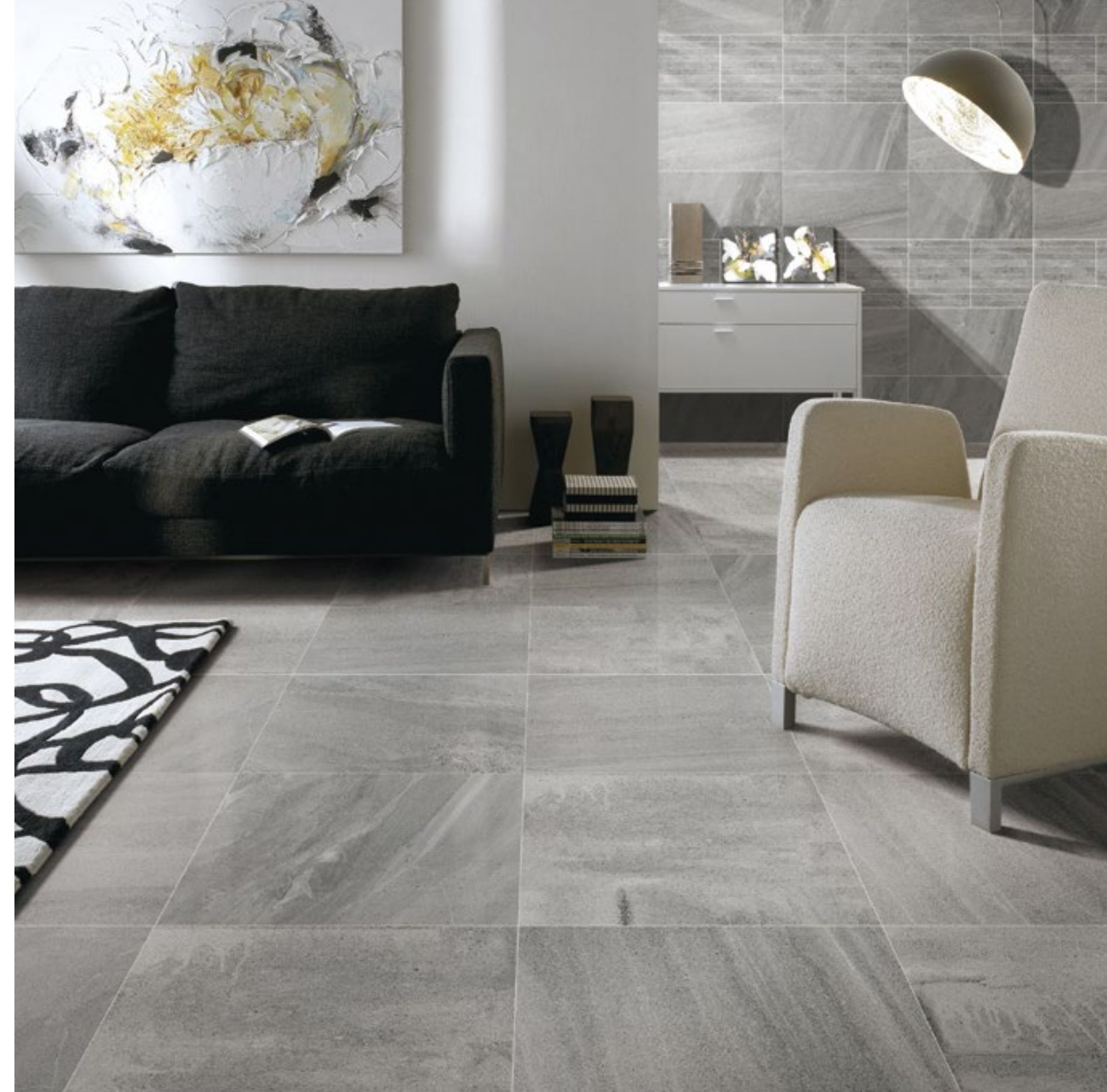
PARTNER FLOOR: 600X600mm WALL: 300X600mm MOSAIC: PARTNER-MA3