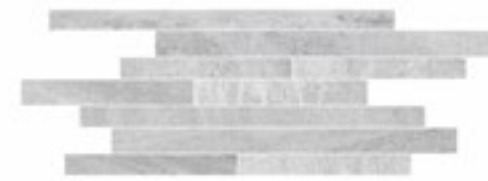
PARTNER-LG MA 10 / 810x275