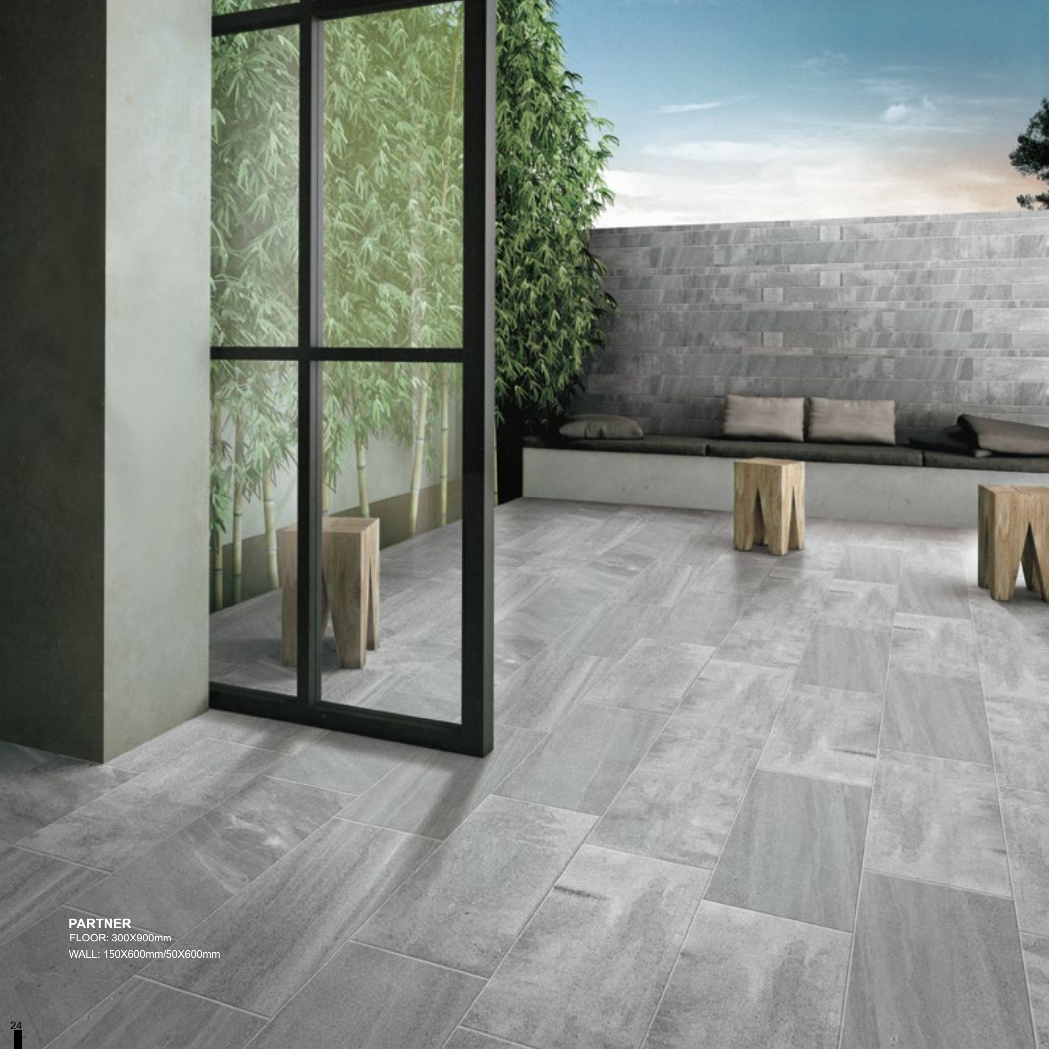
PARTNER FLOOR: 300X900mm WALL: 150X600mm/50X600mm